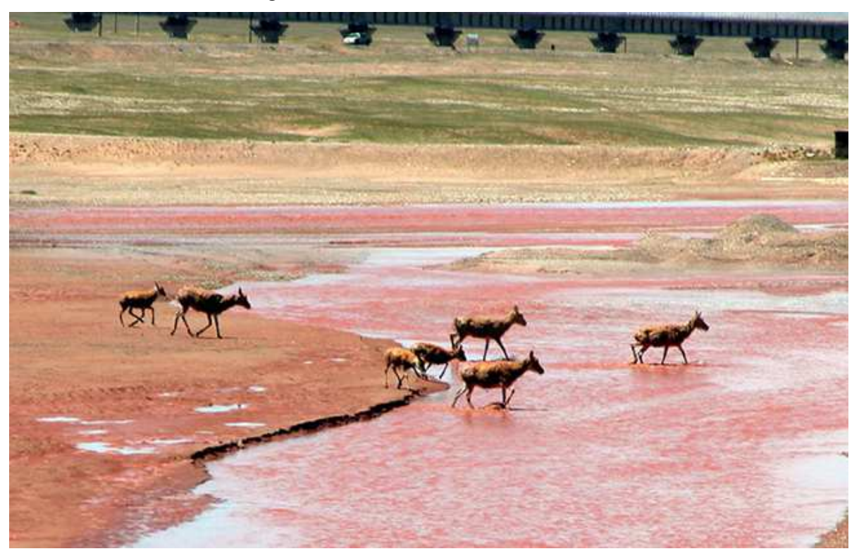
Then, the train heads for the highest spot of the Railway, which is the Tanggula pass (5072 m; cca 8:00):

Shortly passing Yuzhu Peak , the trains enter Kekexili nature reserve , isolated and the least populated region in the northwestern part of the Qinghai-Tibet Plateau in China. It is home to many wildlife such as Tibetan antelope, wild yak, wild Tibetan donkey, etc. Then, the train will arrive at the station of Tuotuo He River , the source of Yangtze River: