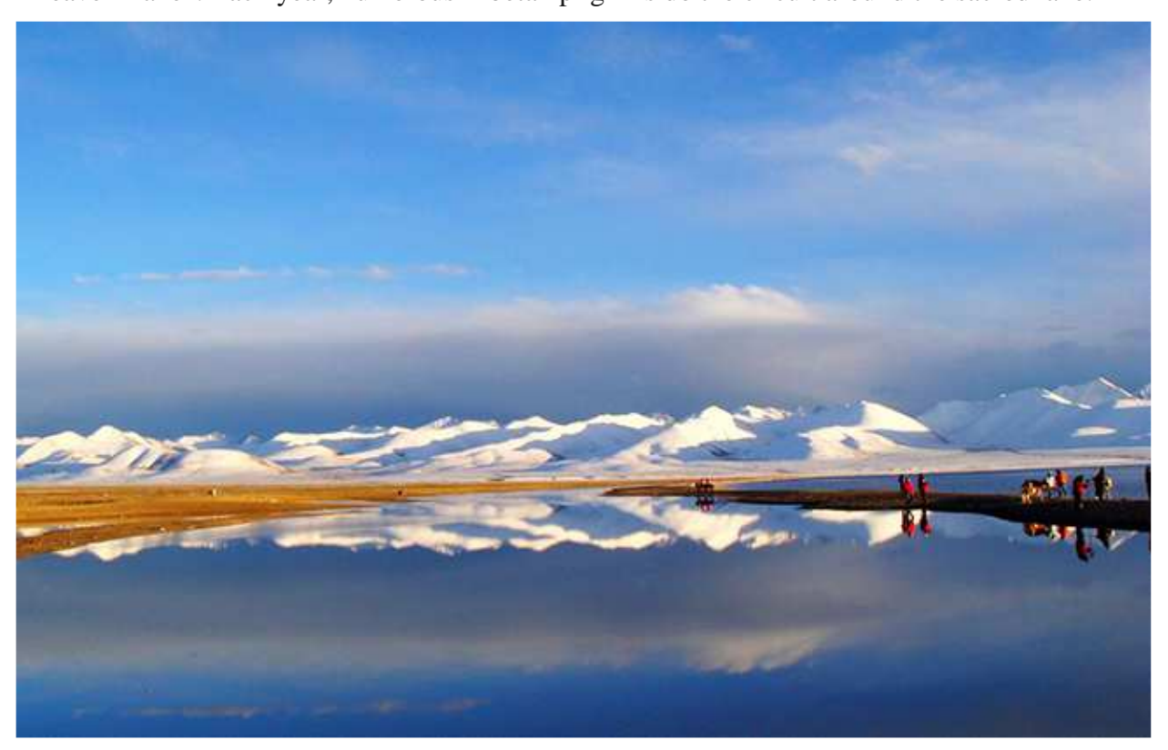
Lhasa , the final destination of Qinghai-Tibet train:

30 km from Damxung railway station, the sacred Namtso , the second-largest saltwater lake in Qiangtang prairie is located (nám zůstane skryto za hřebenem hor). In the Tibetan language, "Namtso Lake" means "Heaven Lake". Each year, numerous Tibetan pilgrims do the circuit around the sacred lake: